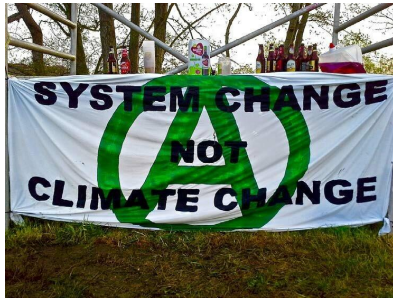
Figure 1: Banner from the inhabited Hambach forest.

guity, however, allows openness and fluidity that supports a pluriverse of various forms of resistance, “counter-conduct” (Foucault 2007: 204), evasive maneuvering (Scott 2009) and “attack” 5 to unfold. Undoubtedly, this is political ecology’s strength. The field is influenced by the student, anti-war and environmental movements of the 1960s to the 1980s. It emerged as a reaction to the methodological shortcomings of ecology (Perreault et al. 2015), famously challenging the surreptitious “apolitical ecology” dominant within the academy (Robbins 2004). Political ecology is an evasive academic field, jumping between anthropology, geography, ecology and development studies, while providing in the process a critical scholarly space within those disciplines. Political ecology is largely fieldwork-based and “politically engaged,” dispelling the technocratic myths of objectivity, challenging epistemic violence and attempting to provide an honest, holistic and critical perspective to the socio-ecological issues of our times. This has led many to claim (see Perreault et al. 2015) that those who identify as political ecol-