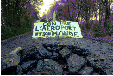
Figure 4: “Against the airport and its world,” NDDL ZAD barricade.

through observation, experimentation and practice. It relies on informal organizing in a highly debated (and evolving) practice (see Anonymous 2011; Weir et al. 2015), challenging colonial forms of organization by emphasizing affinity and fluidity while creating relationships that aim beyond the assembly, the “working group”, and consensus decision making. Informal organizing attempts to bypass the seeds of bureaucracy by organizing outside managerial structures and their hierarchical relationships. All sensitive and relational developments are contingent on environments, and on the social bonds created. Insurrectionary political ecology complements resilience research conceived as resistance to domination (Mullenite 2016) that “generates new forms of life” (Wakefield 2017: 13), as opposed to normalizing the political economy of exploitation. Fukuoka and insurrectionary anarchism can provide pathways of resilience for considering how to politically and ecologically organize with minimal effort, maintain low-logistical overhead and remain evasive. If the building of “counter-institutions” happens, arguably, it is best to keep them illegible to authorities and attentive to concentrations of power.